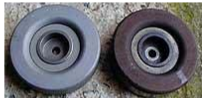
The new and the old